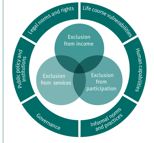
Figure 1. Dimensions and drivers of social exclusion

inter-generational transmission of poverty (de la Brière and Rawlings, 2006; Fiszbein and Schady, 2009).